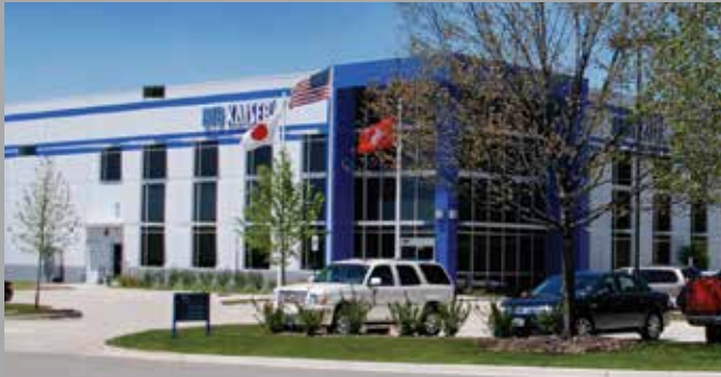
BIG KAISER — USA