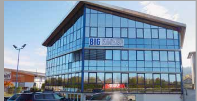
BIG KAISER — GERMANY