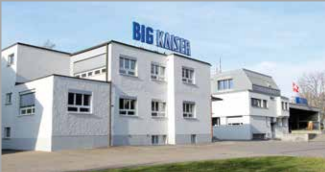
BIG KAISER — SWITZERLAND