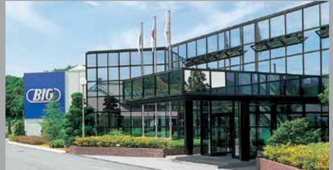
BIG DAISHOWA — JAPAN